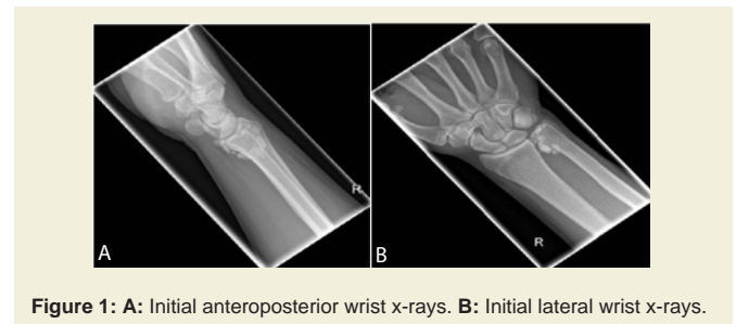
Figure 1: A: Initial anteroposterior wrist x-rays. B: Initial lateral wrist x-rays.

also depicted multiple coarse calcific densities around the distal ulna and the DRUJ (Figures 2A-2C). Triangular fibrocartilage complex (TFCC) appeared intact. Focal erosion was identified in the distal ulna laterally and at the level of the DRUJ. Erosions were also identified in the carpal bones.