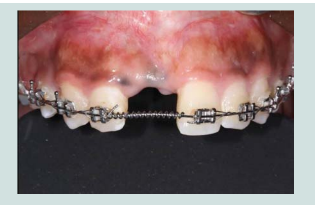
Figure 1: Pre-operative clinical frontal view showing a severely atrophic anterior maxillary edentulous ridge.