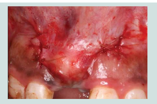
Figure 10: Tension-free soft tissue closure was achieved with 4-0 Chromic Gut.

and reducing trauma to the soft tissue, allowing to maintain primary closure uneventfully, which is vital for any grafting procedure. In contrast to the open-flap techniques, the tunnel technique allows better soft tissue closure, and thus helps in reducing the chances of soft tissue dehiscence, as well as secures bone graft healing. In tunneling techniques, the periosteum is detached during the preparation, but stretched without horizontally cutting it, and thus , the bone graft remains directly in contact with it [23].