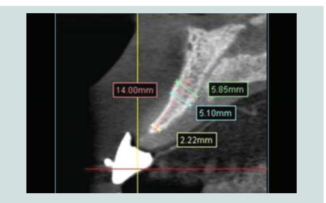
Figure 3: Pre-operative CBCT scan image of Anterior maxillary edentulous area. Note the 2mm thick alveolar ridge.

After 4 months of healing, a new Cone Beam Computed