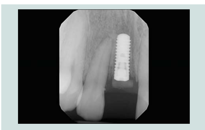
Figure 13: One Straumann bone level implant (4.1x12 mm) was placed.

success of the tunnel technique in grafts [26], since a good adjustment of the graft into the recipient bed promotes greater stability to it. Currently, most of the appositional bone block grafts are stabilized to the receptor through rigid fixation with medical grade stainless steel screws. However, the use of this type of screw requires its removal in a second surgical procedure before the placement of dental implants, causing a more morbid and time-consuming experience for the patient due to this additional surgery. Another drawback associated with the removal of the screws is that it takes a long releasing incision to access them, often in a high-demand aesthetic region [27]. During