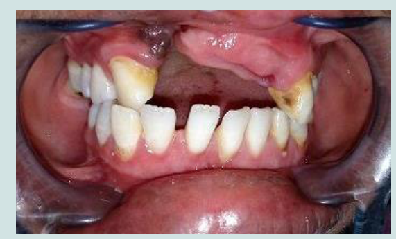
Figure 1: Intra-oral view of cleft segment, post extraction of mobile incisors.

A 21 year old young female patient reported to Department of Prosthodontics, School of Dental Sciences, KIMSDU, Karad, India with a chief complaint of missing upper front teeth, her past dental history revealed repair of cleft lip and palate done in her childhood, also a closure of oronasal communication with grafting using an alloplastic bone graft (Nova Bone) to augment an alveolar cleft located in right anterior maxillary region was attempted. Her medical history did not present any contraindication to dental treatment. Intraoral examination revealed, closure of oronasal communication, an alveolar cleft extended from labial to palatal cortical plate suggesting resorption of alveolar graft, Grade III mobility with respect to 21, 22 and congenitally missing 11 and 12. With a surgical consent, Grade III mobile incisors were extracted. Since the patient did not give consent