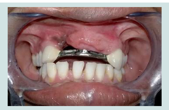
Figure 3: Cemented Rectangular bar with ceramic facing crowns.

for repeat surgical soft tissue augmentation or grafting to restore the defect by placement of dental implants this treatment modality was ruled out. On contrary, the defect being large enough to be self-cleansable, a fixed partial denture was discarded as treatment option. Anon-surgical treatment that is Andrews's bridge system was opted for replacement of missing teeth as well as to restore the adjoining defect. Post extraction, clinical situation revealed that the defect was cone shaped, depending upon tissue loss it was categorized as Siebert's class III. According to semi-quantitative analysis, the vertical and horizontal component of defect measured greater than 6 mm x 6 mm indicating severe alveolar ridge defect (Figure 1).