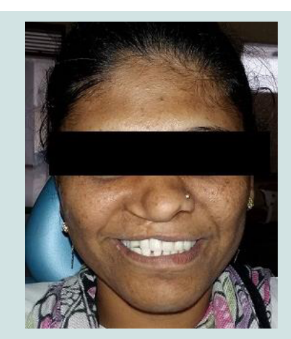
Figure 8: Post Insertion Facial view.

The principle advantage is flexibility in placing denture teeth, restores the facial contour, thereby enhancing esthetics [8,9] has superior adaptability, comfort, and improves phonetics [7,10]. Occlusal forces are directed towards the long axis of abutment teeth. The seating and close adaptation of acrylic saddle on the ridge absorbs all the forces, curved bar ensures lifting and depressing forces are shared by all sectors, the system acts as a stress breaker while transmitting unwanted leverage forces. There is no plate as in removable partial