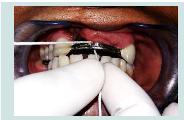
Figure 7: Flossing

labial cortical bone in upper left anterior region, gingival flange was fabricated only on the right side so as to aid in closure of defect with reduced denture bulk (Figure 4).