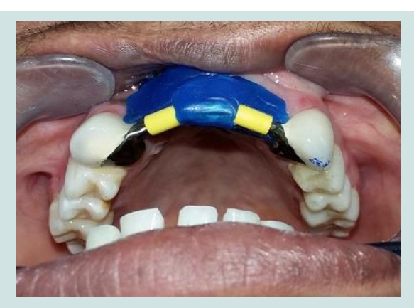
Figure 5: Blocking of Undercut with retentive clips attached.