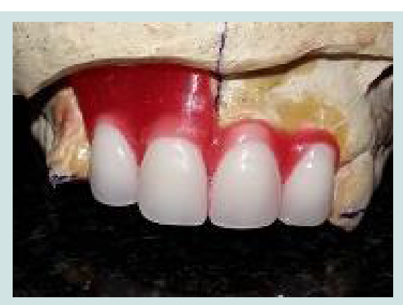
Figure 4: Wax-up of Removable component.

An irreversible hydrocolloid impression (Alginate-Marieflex, Septodent) was made to obtain a cast for fabrication of removable component. The parameters of shade, size and shape of prosthetic teeth (Ivoclar Vivadent India) were selected depending upon the facial features of the patient, age and gender. Since there was adequate