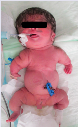
Figure 1: Showing dimorphic clinical findings specially disproportioned large head, with low-set ears, severely shortened limbs, small chest with protuberant belly.

Lethal skeletal dysplasias are rare heterogeneous genetic diseases characterized by abnormal growth and development of bone and/or cartilage [8]. Exact identification of the type of skeletal dysplasia is necessary for proper genetic counseling. Clinical examination and detailed radiographic assessment of the skull, spine, thorax, limbs and pelvis are essential to identify the type of skeletal dysplasia [6]. In our patient, although calcification plaques can be seen, marked reduced mineralization of the calvarium, and severe micromelia were noticed at the first clinical and radiographic examinations. As known, micromelia occurs due to multiple fractures which is the key feature of OI. Important differential diagnoses consist (besides OI type 2) of thanatophoric dysplasia, hypophosphatasia, campomelic dysplasia, and achondrogenesis type I.