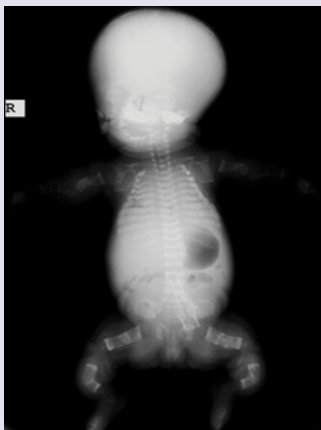
Figure 2a: Showing severe under mineralization of skull, platyspondyly, small thorax with continuously beaded ribs, severely shortened, broad and, crumpled long bones due to occurrence of multiple fractures.