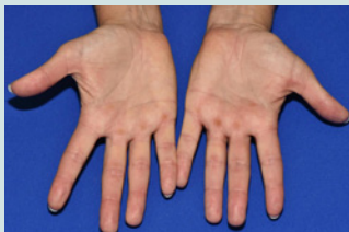
Figure 3: Brownish discoloration of calluses overlying the heads of the metacarpals on the palms.