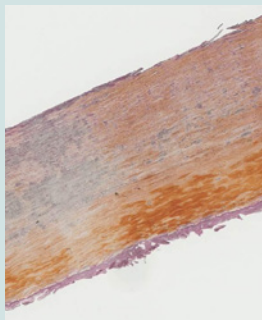
Figure 5: Histopathology with Fontana-Masson staining showed amorphous yellow-brown globules throughout the nail plate.

Only a few cases of nail staining by hydroquinone have been reported previously. All patients were Caucasian using 2-5% hydroquinone topically [2-6]. The acquired hyperpigmentation generally presented in the distal part of the fingernails of one or both hands, was asymptomatic, and worsened with sun exposure although this was not seen in this case. Cessation of the hydroquinone-containing creams or use of gloves to protect the nails resulted in complete resolution of the discoloration within 1-3 months [2-6].