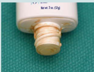
Figure 4: Brown discoloration on lid of hydroquinone product used by the patient.