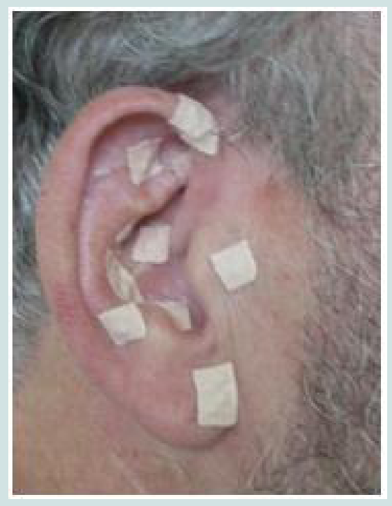
Figure 2: Real image of the patient's ear during the auricular acupuncture treatment

The patient also related that as a youth, he was very sexually active with prostitutes, so the author asked for some laboratory exams to detect any sexually transmitted diseases such as HIV, syphilis, and hepatitis B and C, but all the results were negative.