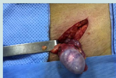
Figure 2: Macroscopical appearance of the testicle.