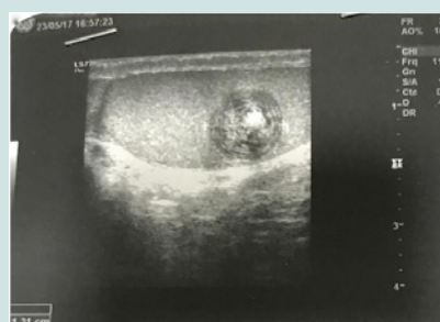
Figure 1: Ultrasound.

Testicular cancer is relatively rare, with only about 5,500 new cases reported per year in the United States [2].