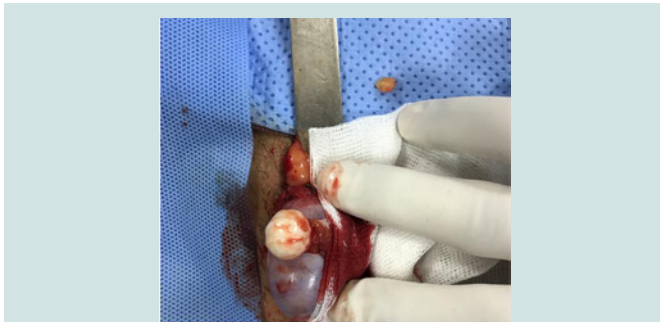
Figure 3: Macroscopical appearance of the tumor.