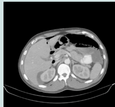
Figure 1: CT scan with oral and intravenous contrast demonstrating benign pneumoperitoneum following laparoscopic sleeve gastrectomy.

University of Milan, School of Medicine, Italy