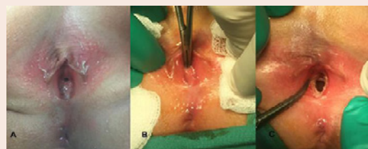
Figure 2: Physical exam and treatment. A) Normally positioned anus, inflammatory vestibule and imperforate hymen. B,C) Hymenectomy done revealing a hypospadiac urethra.