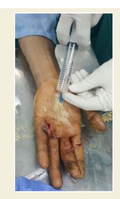
Figure 2: Subcutaneous fat in the center of the phalanx to avoid injuring digital nerves with the level of the needle.

All patients had two views plain X-ray on the hand region and none of them had associated injuries whether fracture, dislocation,