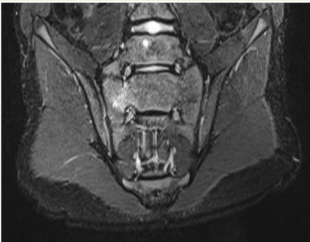
Figure 3: MRI showing healing fracture.

activities. However, against medical advice, he continued to go to school and to perform daily-life activities, although he stopped to play soccer.