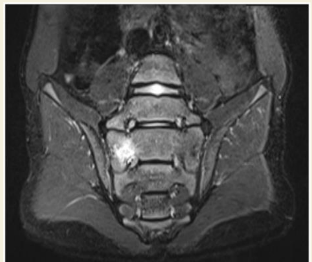
Figure 1: MRI image consistent with a stress fracture.

It was recommended a four weeks cessation of heavy physical