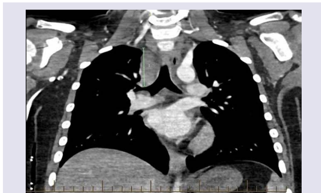
Figure 2: CT chest showing the presence of right paratracheal and subcarinal soft tissue enlargement suggestive of lymphadenopathy.

suggestive of lymphadenopathy. Epstein Barr virus, cytomegalovirus, and toxoplasmosis serology was negative and there was no history of exposure to tuberculosis. An USS guided transbronchial needle aspiration of the mass was performed. Microscopy showed polymorphic neutrophils and no malignant cells. Gram stain and direct aerobic and anaerobic cultures were negative, but the enrichment (broth) culture of the aspirate grew Actinomyces species which was further identified as A. odontolyticus by DNA sequencing of the 16S rRNA gene. An antibiotic sensitivities panel was unable to be produced in view of the molecular technique used. The diagnosis of mediastinal actinomycosis was established. The patient was commenced on daily ceftriaxone in view of universal sensitivity of the species to beta-lactam antibiotics and the convenience of a once daily delivery pattern. A follow up CXR showed significant reduction in size of the mediastinal widening four weeks later. The patient completed a six month course of treatment at which point a CT chest showed complete resolution of the mediastinal mass.